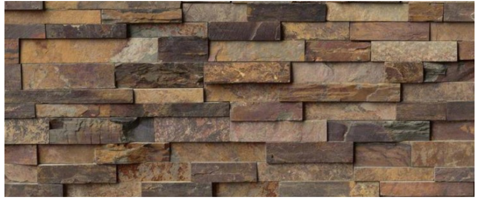
California Gold Rush