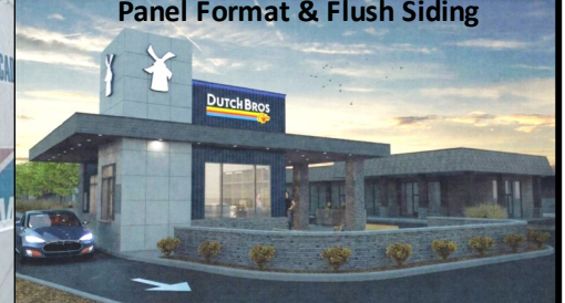
Panel Format & Flush Siding