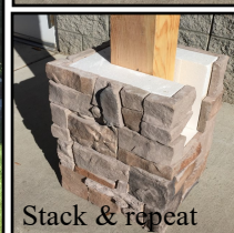
Stack & repeat