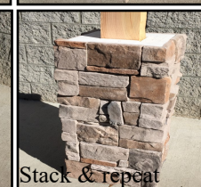
Stack & repeat