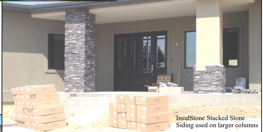
InsulStone Stacked Stone Siding used on larger columns