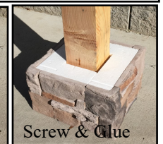
Screw & Glue